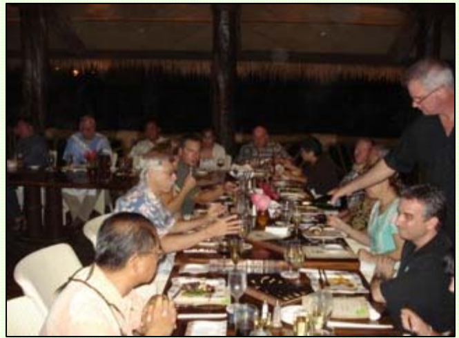
Everyone enjoying themselves at Humu's